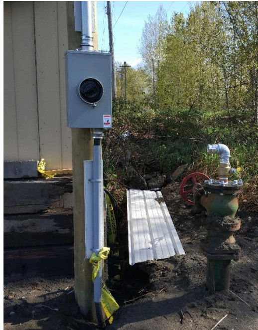
Photo 13 New upgrades to the utility pole.