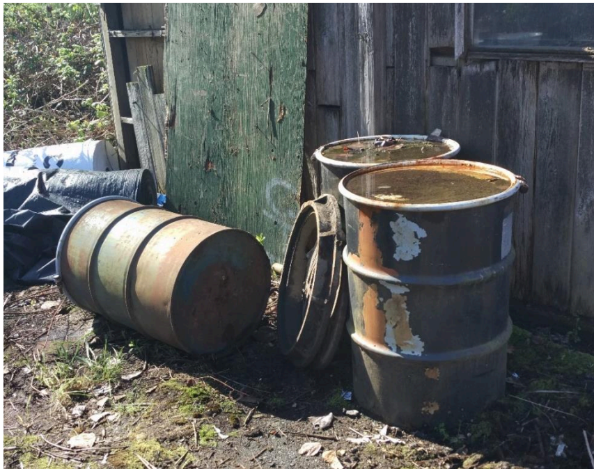
Photo 16 Unlabeled drums outside disused oil storage shed.