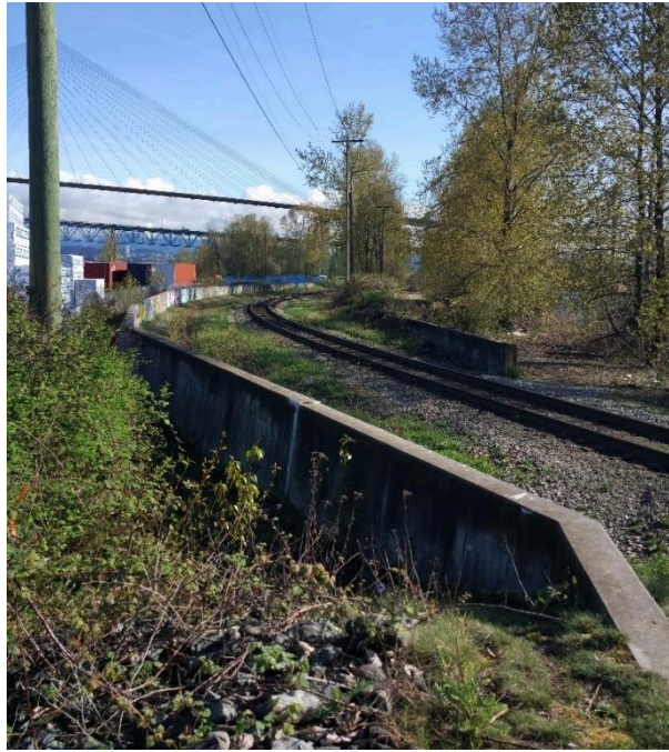
Photo 3 Canadian National Railway, located along the southeastern Site boundary.