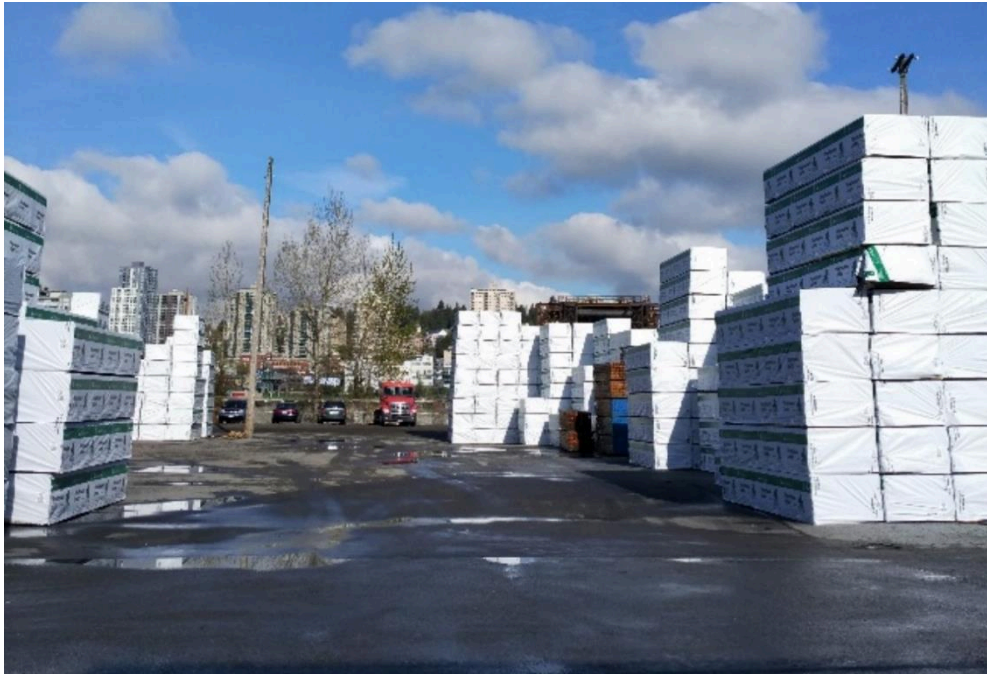
Photo 6 View of the site, facing northwest.