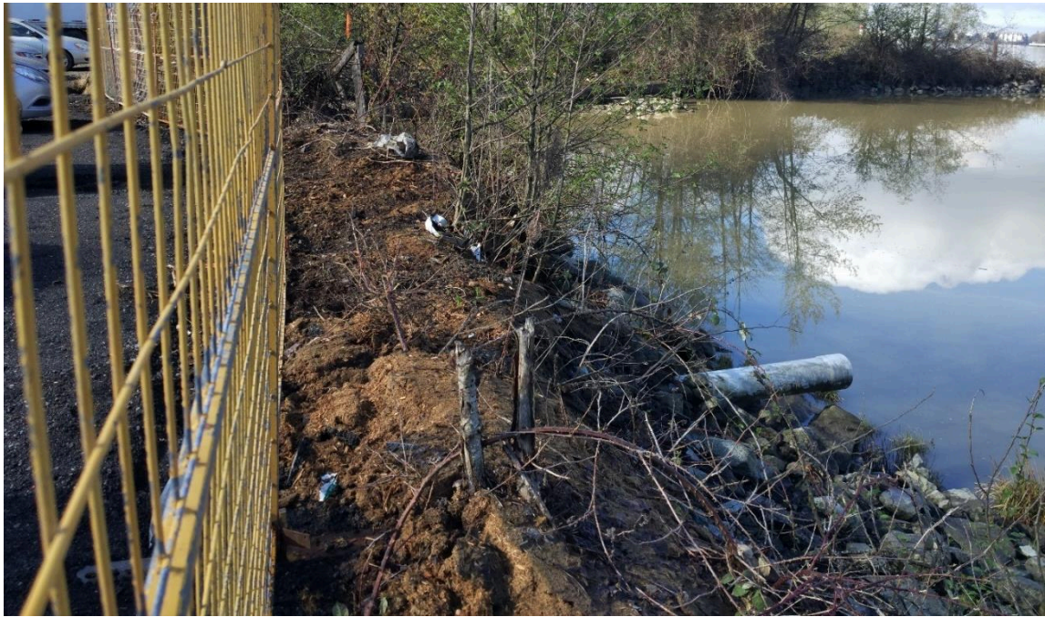
Photo 7 Surface water discharge drain into Fraser River to the northwest of the Site.