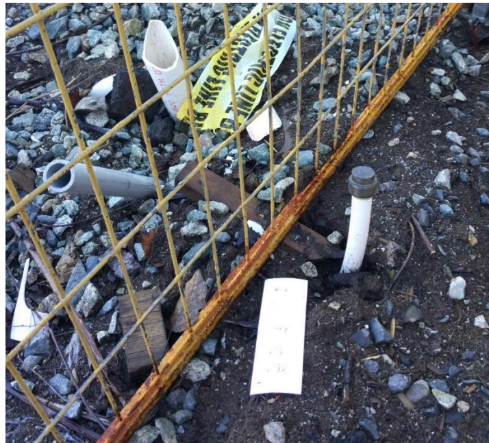
Photo 8 Nested monitoring wells (?) at northwestern Site boundary.