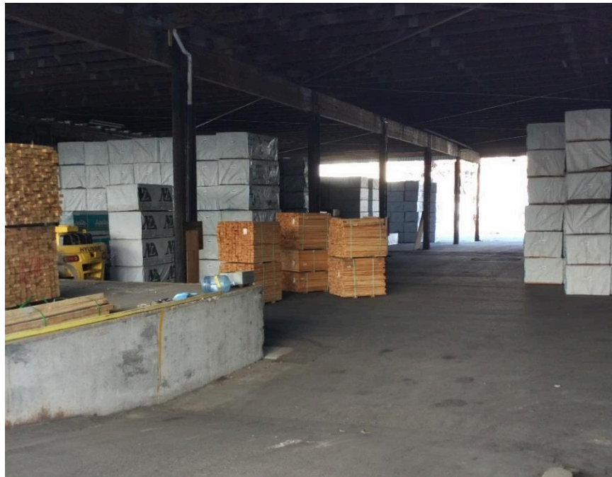
Photo 10 View into the storage warehouse towards the northwest.