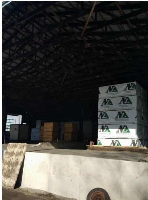
Photo 4 Open warehouse building for wood storage.