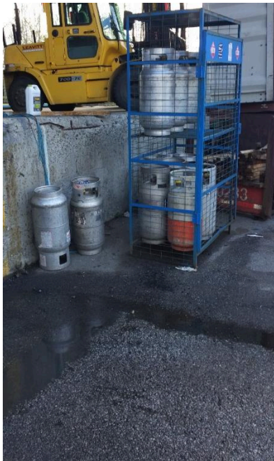
Photo 12 Propane storage inside the warehouse.