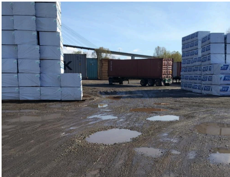
Photo 2 View of unpaved area of the Site, towards northeast.