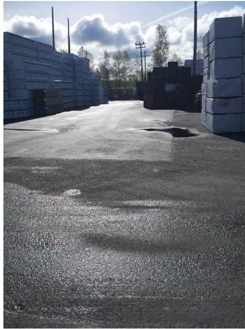
Photo 1 View of the Site, showing newly upgraded pavement, facing northwest. Electrical poles show that old lines have been removed due to fire hazard.