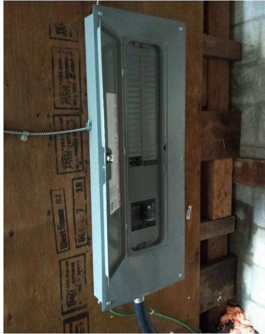
Photo 5 Newly installed electrical panel.