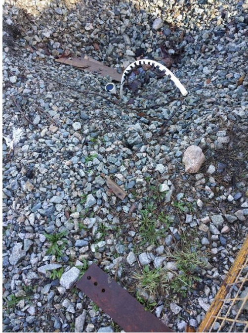
Photo 9 Nested monitoring wells (?) at northwestern Site boundary.