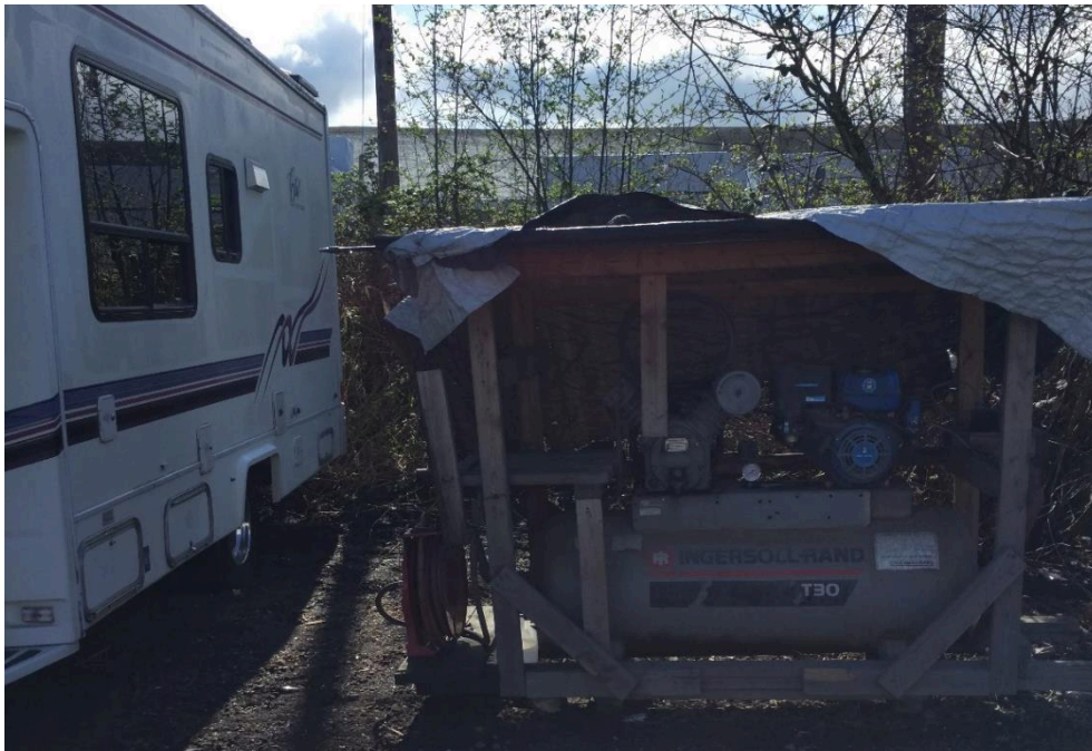
Photo 14 Air compressor system outside office trailer. Located near the southern Site boundary.