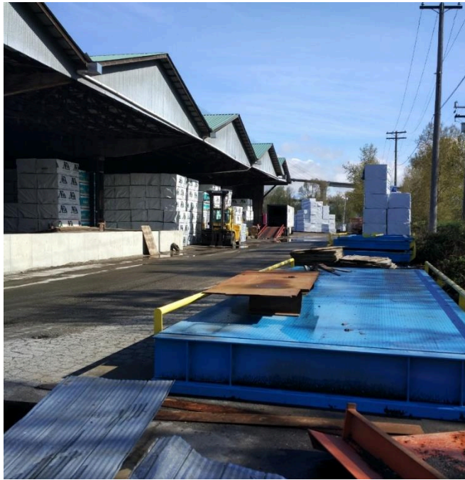
Photo 17 View from the southeastern Site boundary, along the storage warehouse.