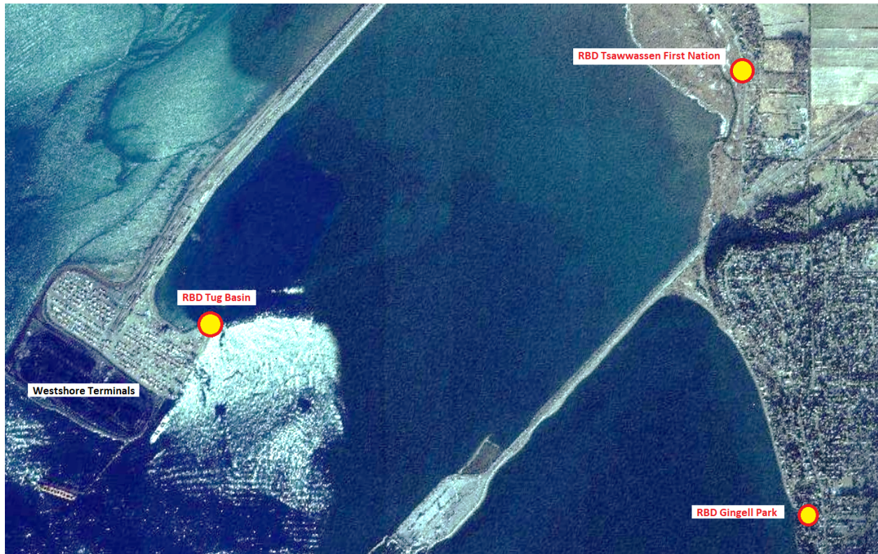
Figure 3 Locations of Permanent Port Vancouver Noise Monitoring Stations

Reference: Westshore Terminals Ltd. – Qualitative Noise Assessment - Potash Expansion Project