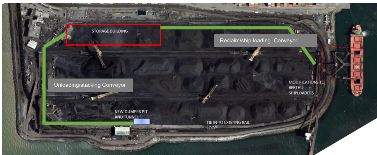
Figure 1 Project Overview

Potash will be stacked and stored inside the new storage building by an overhead tripper conveyor. Coal will continue to be stockpiled outside in the yard by the four existing stackers/reclaimers (S/R) (visible in Figure 1). Potash will only be loaded onto ships at Berth 2.