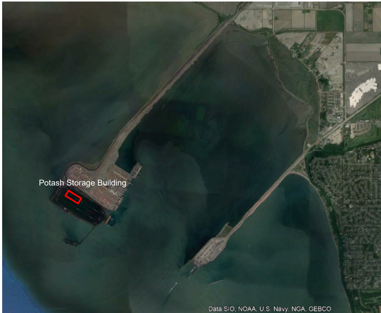
Figure 4 Potash Storage Building Location

Reference: Westshore Terminals Ltd. – Qualitative Noise Assessment - Potash Expansion Project