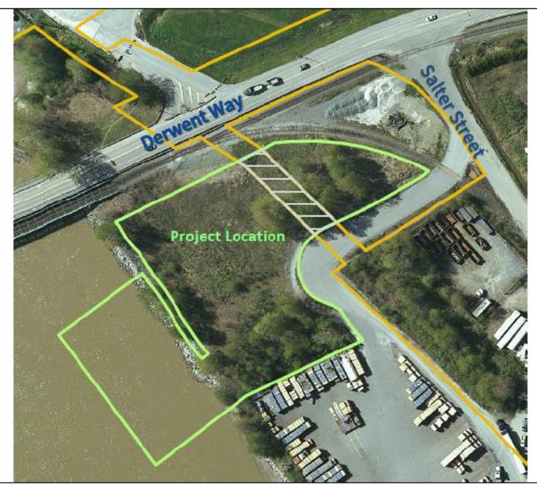
Site Location Aerial Photograph

The proposed facility would be constructed to have a lined and paved temporary soil storage area, a perimeter wall with a tree hedge and sound barrier, truck wheel wash station, a water treatment system, and a floating barge ramp.